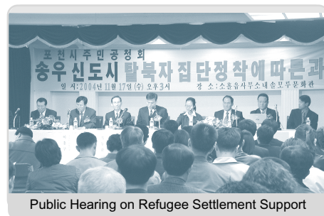
Public Hearing on Refugee Settlement Support

Upon entering society, depending on their income and personal assets, refugees will be designated to be eligible for medical benefits and exempted from all medical fees. For the physically challenged and those with no means of income, the government assigns them as welfare recipients. Since August 1, 1999, local municipalities have designated officials in an effort to strengthen settlement support activities and for protecting and supporting refugees residing in their jurisdictions. These officials will provide administrative support and consultation to help refugees better assimilate into the local society.