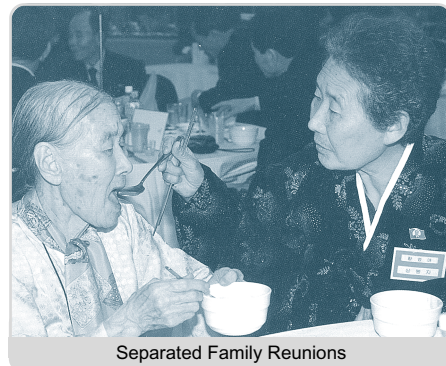
Separated Family Reunions

Since the two Koreas agreed to settle humanitarian issues including the issue of separated families as soon as possible in the June 15 Joint Declaration issued at the end of the South-North Summit in 2000, a total of 8,045 family members have been reunited with their families and relatives in eight rounds. The first three reunions, which began in August 2000 and continued until February 2001, took place in both Seoul and Pyongyang simultaneously. Starting from the fourth round in 2002, the reunions took place at Mt. Geumgang.